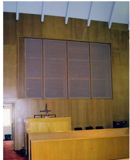
Swell and Choir chambers before renovation (chancel right)