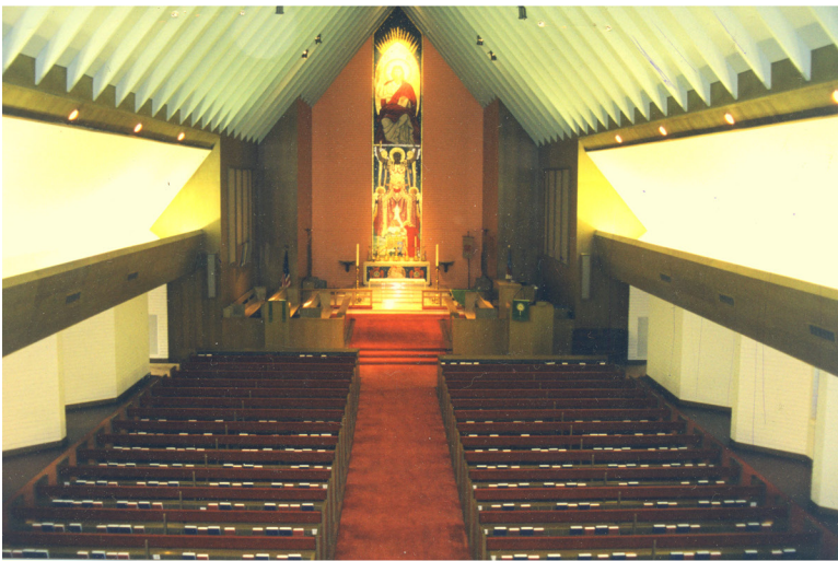
St. Edmund's interior before renovation